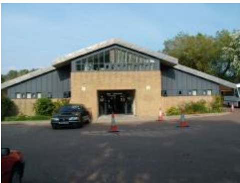
Day Centre for Age Concern, New Romney