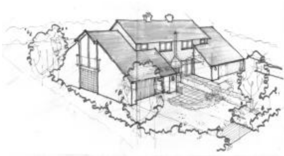
Proposal for improvements to cottages at Horton Park farm.