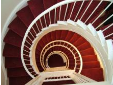
Temeraire Heights, Margate

39 Bouverie Square, Folkestone, Kent CT20 1BA Telephone: 01303 246400 Facsimile: 01303 246455 email: info@rogerjoyceassociates.co.uk www.rogerjoyceassociates.co.uk